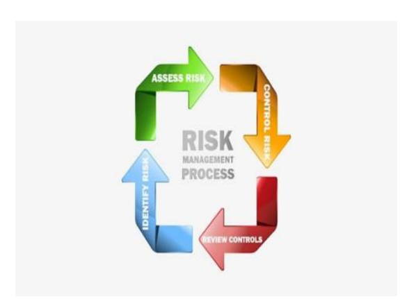
Fig -1: HIRA Process